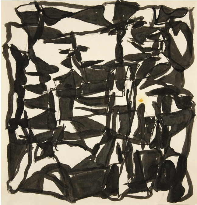
Untitled (Ink) 2015