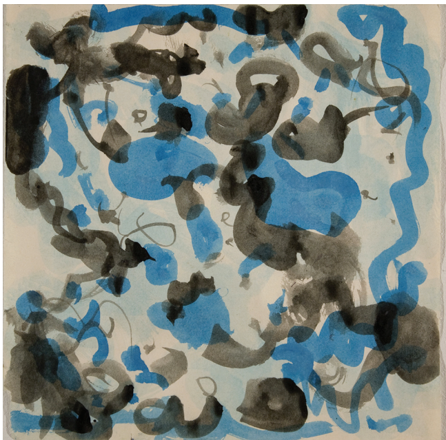
Untitled (Turquoise) 2014