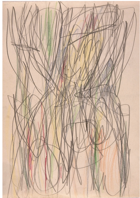
Untitled (Colored Pencil) 2008

I keep sketchbooks but tend to rip out their pages when they have something to do with my painting. I hang them up around the studio. Once in a while, a sketch will serve as a beginning to a painting. Other times, sketches help me change direction in a painting so I can move forward. Sometimes, I sketch during the process of painting to record what is there temporarily, just before I cover it up, as a record which might direct me later. I also make sketches to loosen up, not as a means to an end but as an end in itself. Sometimes the sketches have color, sometimes they are stark black and white. I might use pencil or charcoal or crayon or ink and watercolor with brushes.